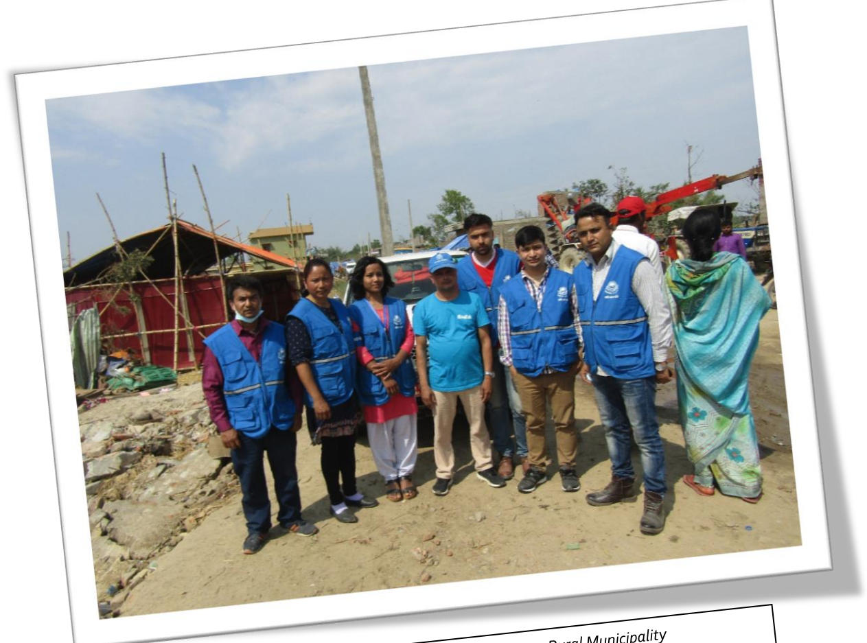
Team Members of Emergency Relief Medical Mission at Pheta Rural Municipality