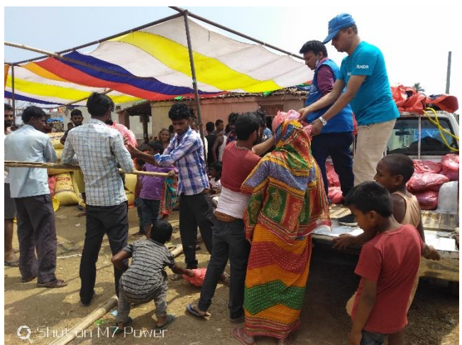
Relief material distribution at Pheta rural municipality