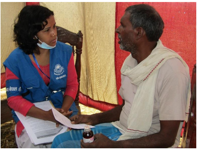
Psychosocial Counseling in ER Clinic